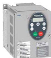
Lennox speed controller