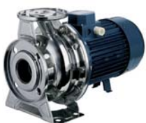
Lennox variable speed pump